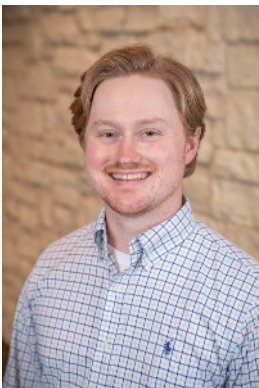
MASON HILL HIGH SCHOOL MINISTER